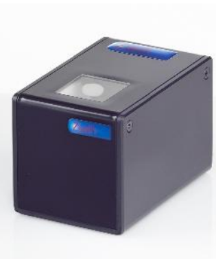
DataPaq Single Tube Scanner without Cryoprotection™. After repeated scanning, condensation starts to appear