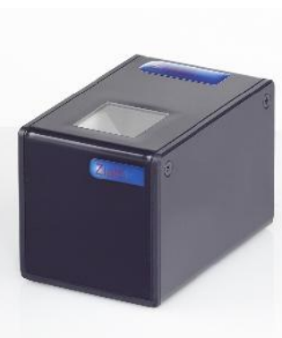
DataPaq Single Tube Scanner with Cryoprotection™. No condensation has formed